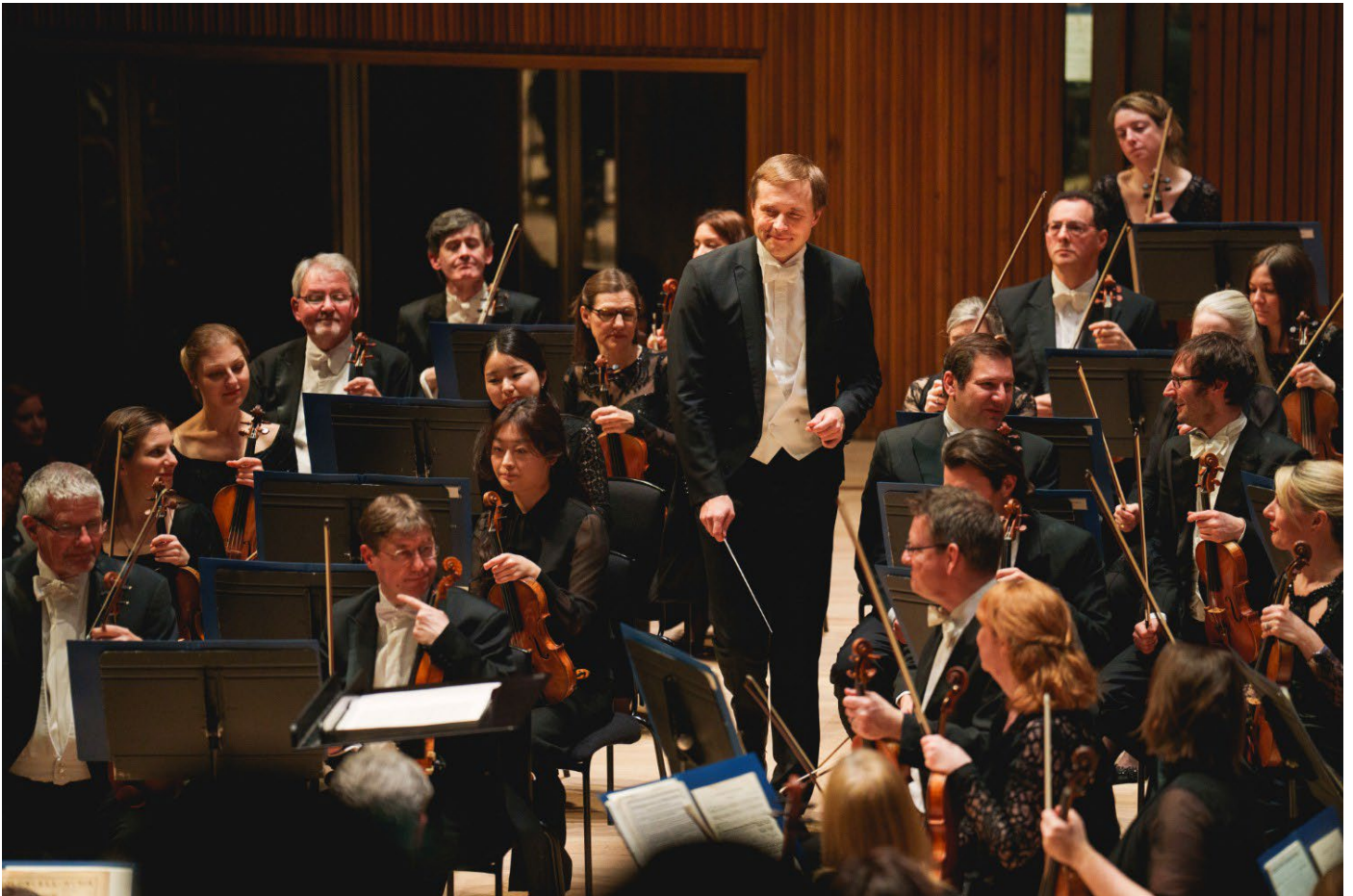
Vasily Petrenko and the Orchestra at the Southbank Centre's Royal Festival Hall, Feb 2023

Royal Festival Hall: Each year the RPO presents a season of symphonic concerts on the banks of the River Thames at the Southbank Centre's Royal Festival Hall.