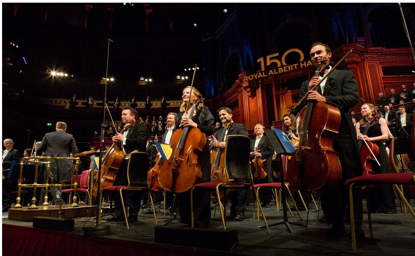
The RPO at its 75th Anniversary Gala Concert at the Royal Albert Hall, Sep 2021