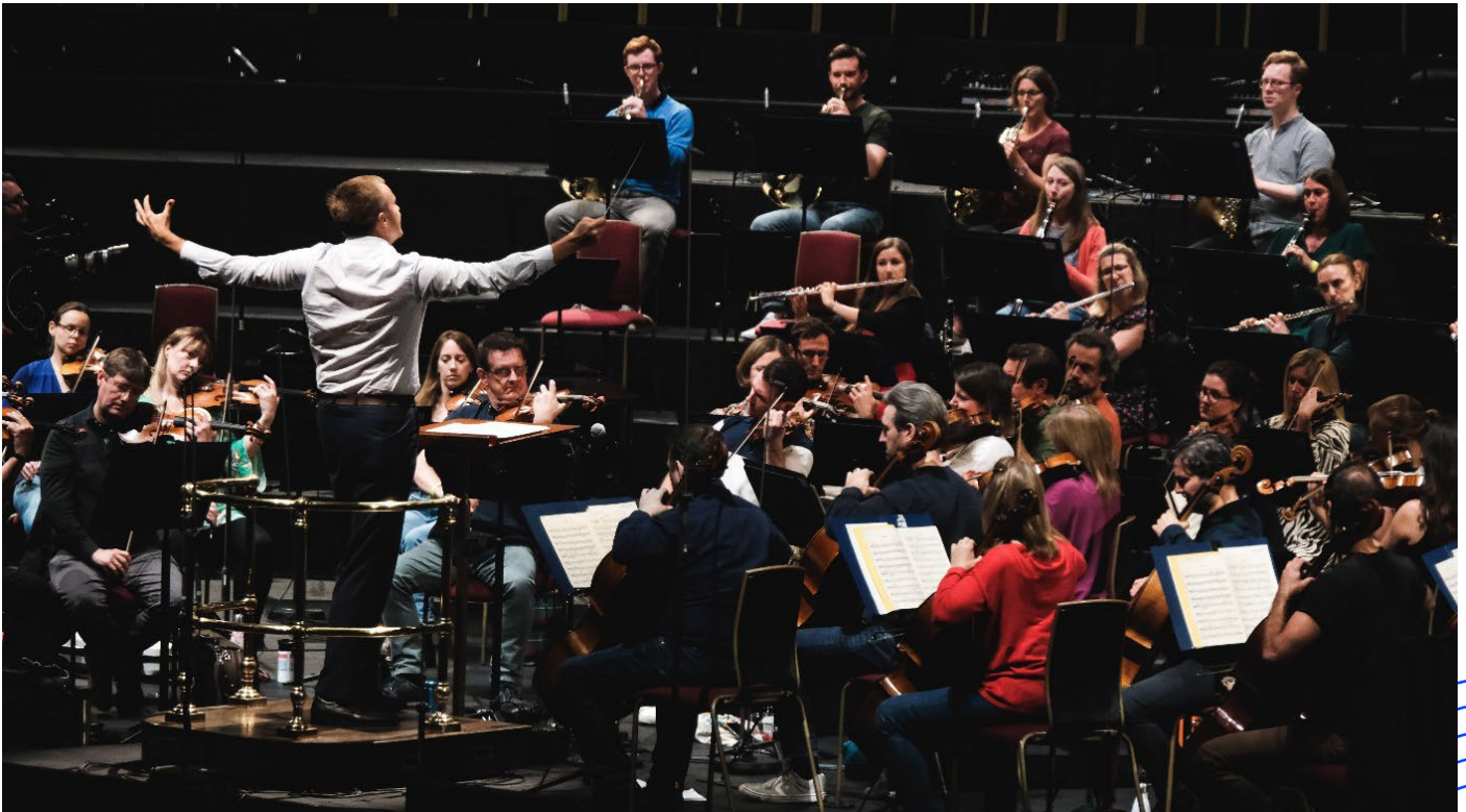
Vasily Petrenko rehearses the Orchestra for the RPO's 75th Anniversary Gala Concert at the Royal Albert Hall, Sep 2021

Read our Inclusion and Diversity Policy: rpo.co.uk/inclusion-and-diversity-policy