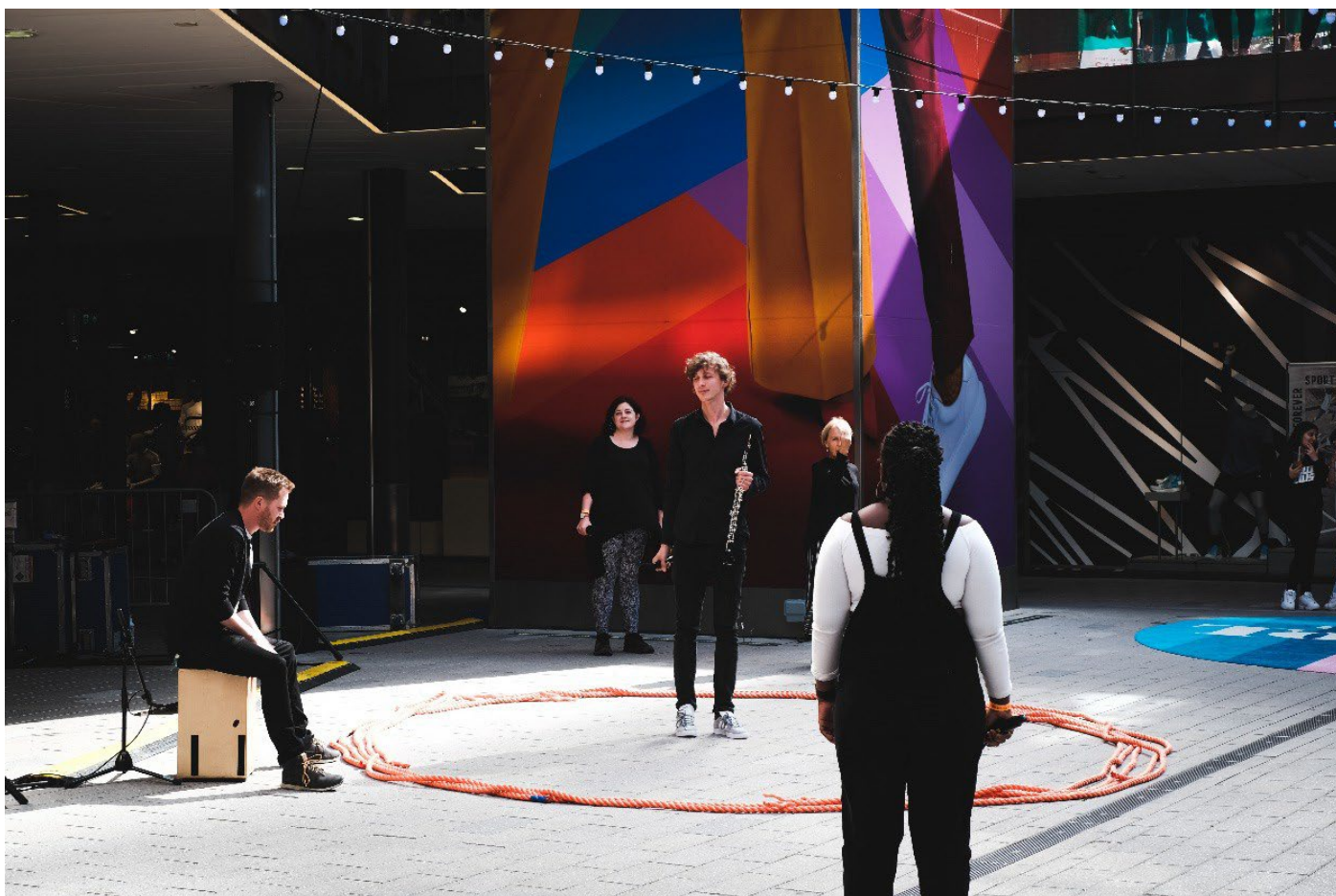
RPO musicians perform with spoken word poetry group WordUp in Wembley Park for Wemba's Dream, Sep 2021

Thank you for your interest in the Royal Philharmonic Orchestra. We really hope we have inspired you to want to develop your career with us, and to helping us towards a vibrant future.