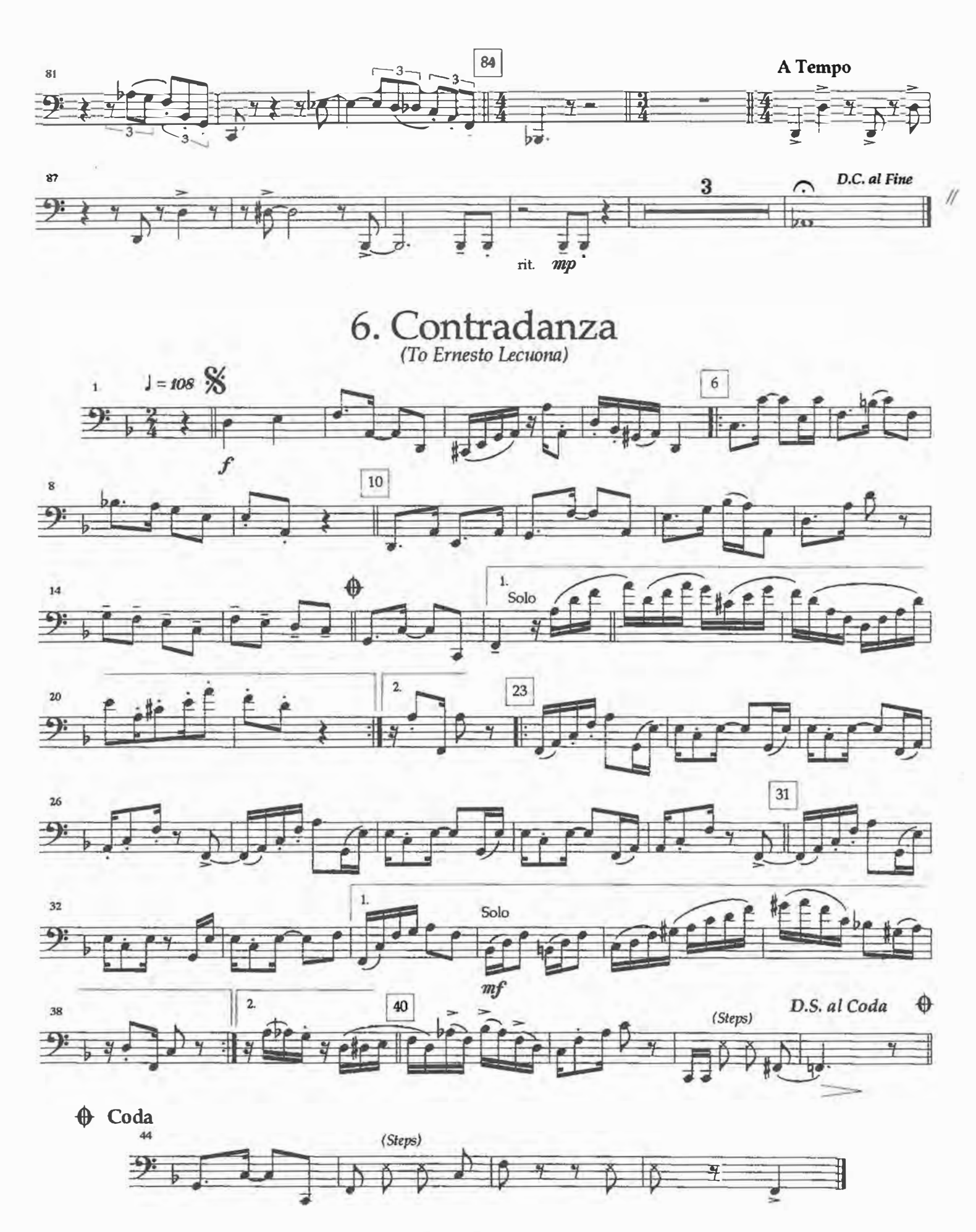
- Aires Tropicales (Bassoon) p. 8 -