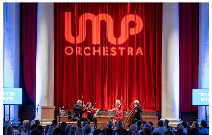
LMP players performing at Tasting Notes, Smith Square Hall

Community and education work is at the heart of what we do at LMP. We have been delivering musical outreach projects since 1989 and in 2024, we reached over 3000 school children through our programme. Recent community-driven projects have included 100 Faces of Croydon and Oratorio of Hope, both featuring at Fairfield Halls as part of Croydon's year as London Borough of Culture.