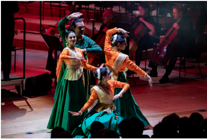
Subrang Arts and LMP performing at Fairfield Halls, April 2023

Whilst we're proud of our long-standing history, we don't believe that longevity alone should be the measure of what makes a successful orchestra. As we look to the future, we're giving much more attention not only to what we do, but the way we do it.