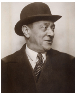
Arnold Schönberg, Berlin, 1930

Arnold Schönberg (1874 – 1951) composer, teacher and theoretician was one of the defining figures of the 20 th century. Advocating progress in music, Schönberg embodied the courage to break with conventions.