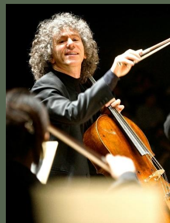
Soloist, chamber musician, author, educator, broadcaster

He plays the 1726 'Marquis de Corberon' Stradivarius, on loan from the Royal Academy of Music.