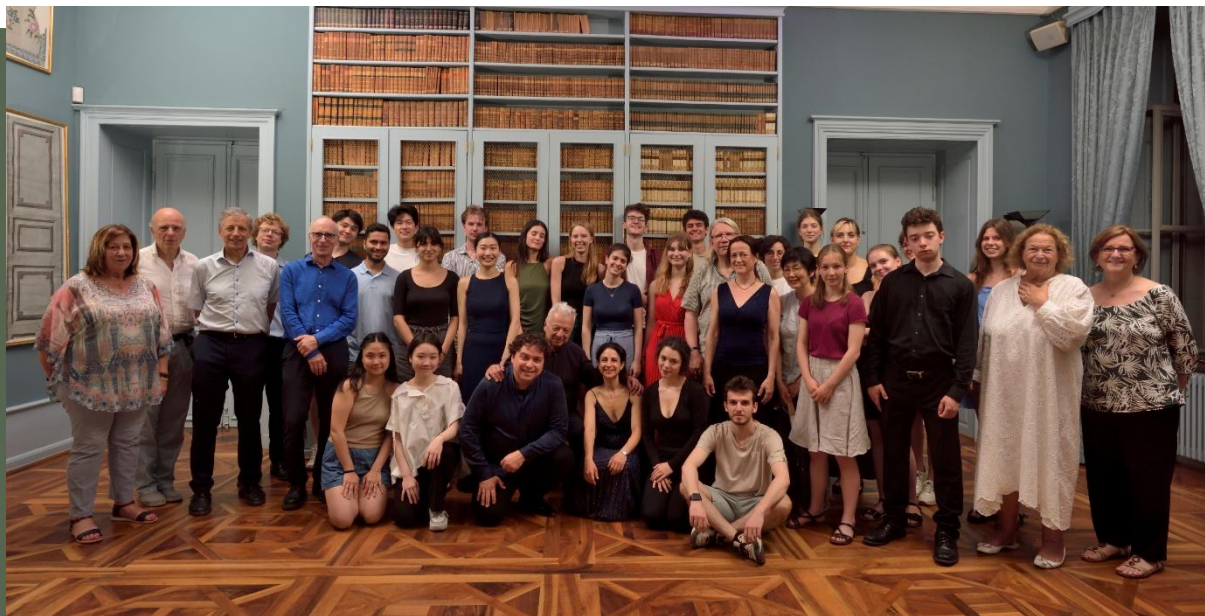
Professors, Participants, Organization - July 2025

https://genevastringacademy.com/en/contactus