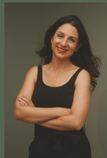
Violist of the Aviv Quartet