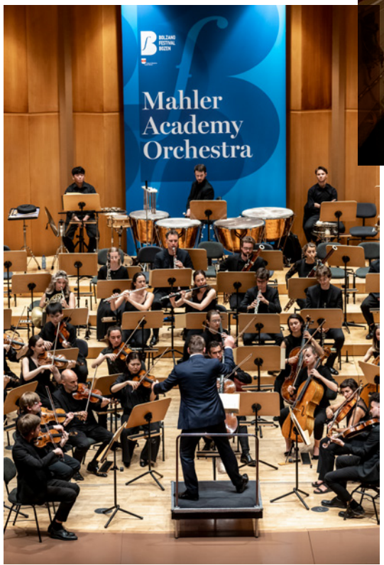
Bolzano - Bozen

"It felt as if Gustav Mahler himself was back in the building." Trouw