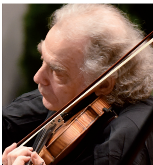
Zakhar Bron Violin