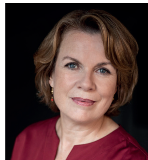
Bernarda Fink Voice