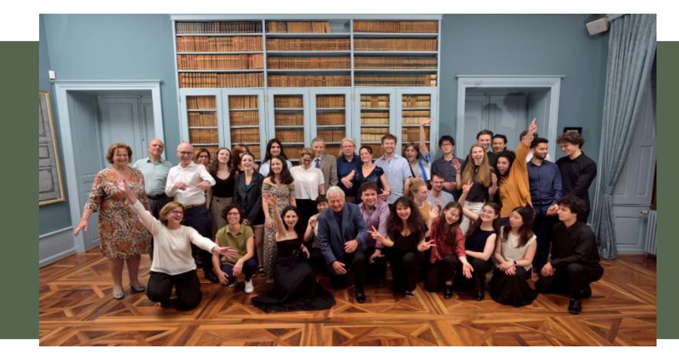
Professors, Participants, Organization - July 2024

https://genevastringacademy.com/en/contactus